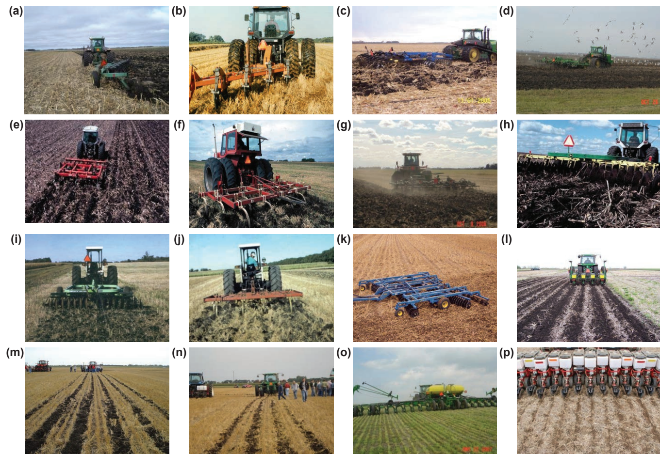
Collection of several different types of “conservation tillage” tools and planters illustrating a wide range of tillage depths and degrees of residue incorporation (from left to right and top to bottom): (a) conventional inversion moldboard plow, (b) paraplow, (c) deep ripper combination tool, (d) deep field cultivator combination tool, (e) field cultivator tool rigid tine (photo courtesy of the Natural Resources Conservation Service [NRCS]), (f) deep field cultivator spring tine (photo courtesy of NRCS), (g) deep field cultivator rigid tine, (h) heavy-duty disk harrow (photo courtesy of NRCS), (i) shallow field cultivator spring tine, (k) vertical tillage tool (photo courtesy of NRCS), (l) high disturbance strip tillage implement combination tool, (m) strip/zone tillage implement in wheat stubble, (n) strip tillage implement combination tool rigid tine, (o) disc opener no-till planter into alfalfa stubble, and (p) disc opener no-till planter into dead residue (photo courtesy of Dave Brandt).